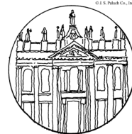
The Dedication of the Lateran Basilica

There are all sorts and kinds of birthday parties. Church buildings, as well as the people who use them, have anniversaries for their beginnings. On November 9th , it is for Our Savior's Basilica and Saint John's Baptistery, the pope's cathedral as bishop of the people of Rome. We belong to the "Roman family" in the church, so it is our feast too. Celebrate the Lord's coming! God's people are truly the place of Christ's presence in this world. We would all do well to celebrate the birthday of our own church or parish or community of faith and acknowledge Christ's presence with thanks.