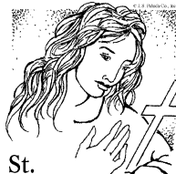
St. Mary Magdalene

Service Awards & Ministry Recognition Sunday, July 23, 2017 at 11:00 AM Mass