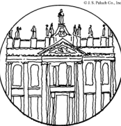
The Dedication of the Lateran Basilica

There are all sorts and kinds of birthday parties. Church buildings, as well as the people who use them, have anniversaries for their beginnings. On November 9th , it is for Our Savior's Basilica and Saint John's Baptistery, the pope's cathedral as bishop of the people of Rome. We belong to the "Roman family" in the church, so it is our feast too. Celebrate the Lord's coming! God's people are truly the place of Christ's presence in this world. We would all do well to celebrate the birthday of our own church or parish or community of faith and acknowledge Christ's presence with thanks.